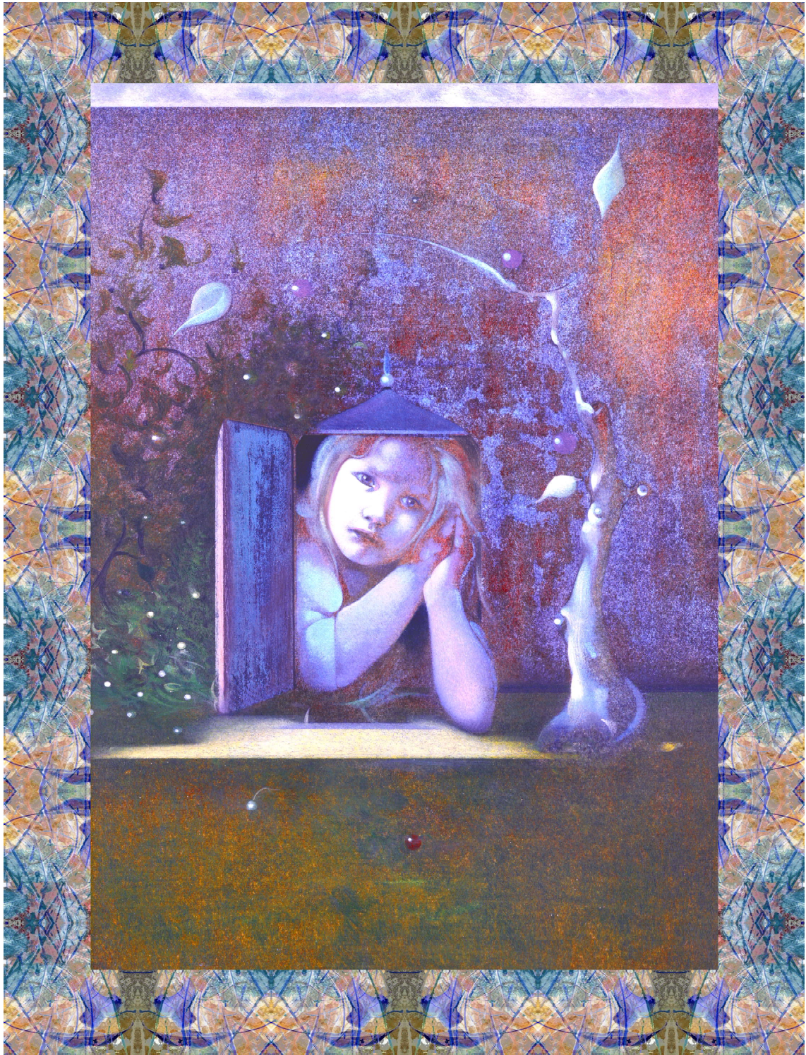
The Beautiful Garden