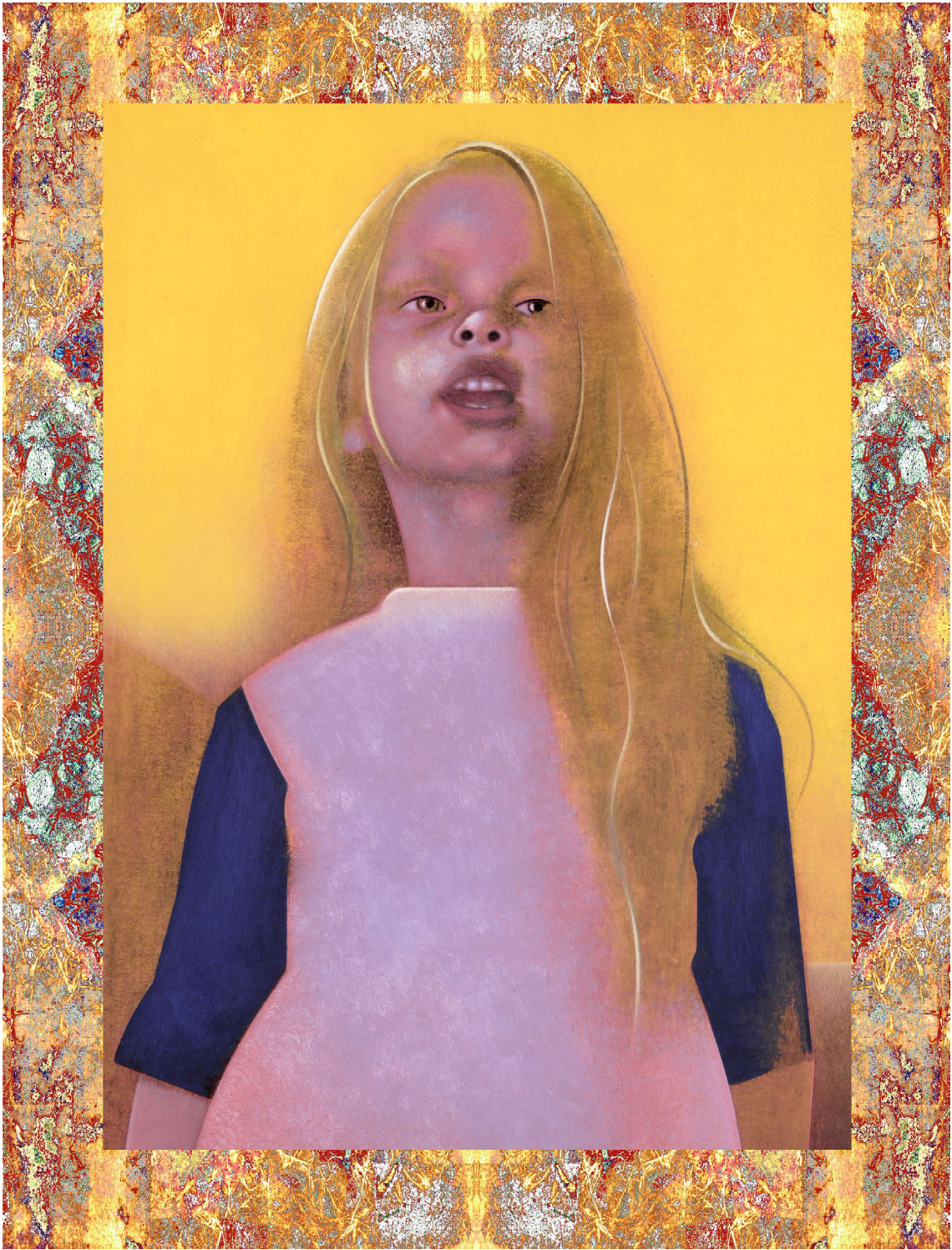
The Rabbit sends in a Little Bill