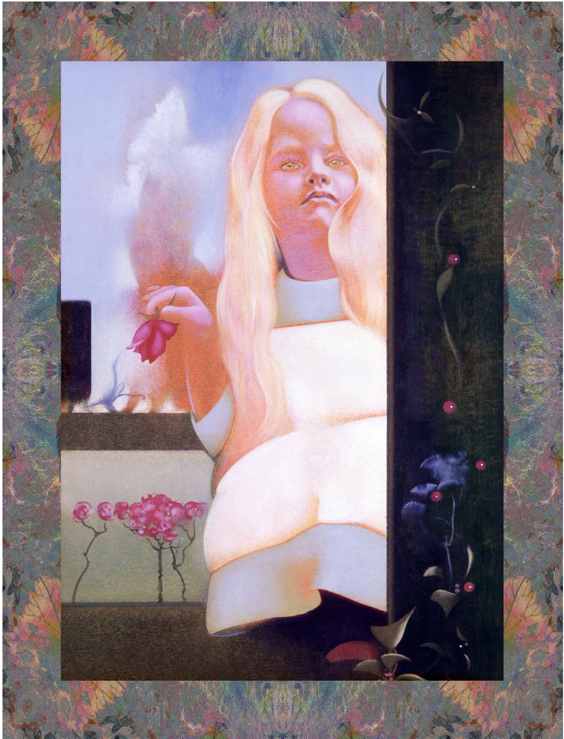
The Queen's Croquet-Ground