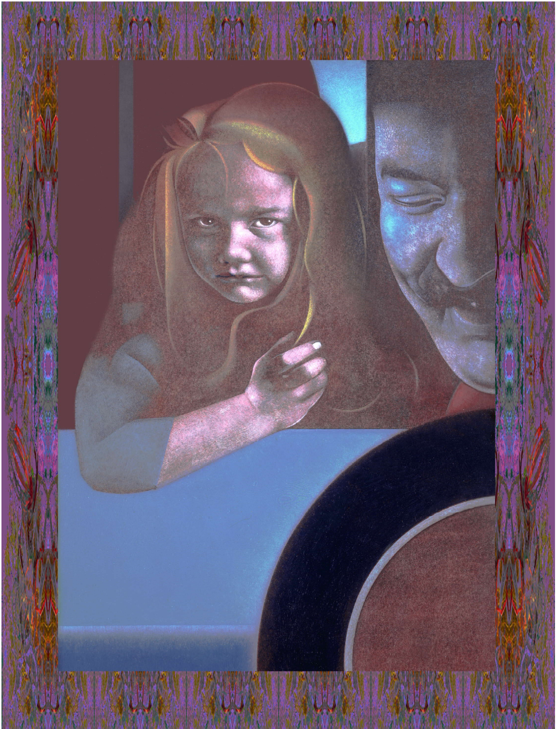
The Mad Hatter