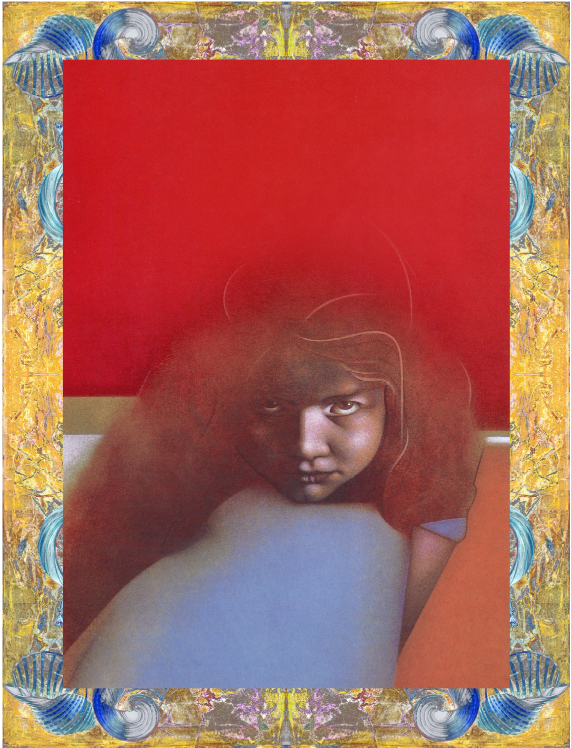
The Mock Turtle's Story