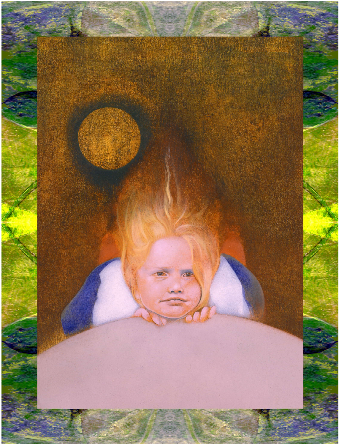
Advice from a Caterpillar