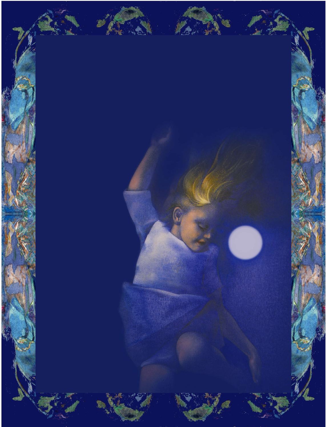
Down the Rabbit Hole