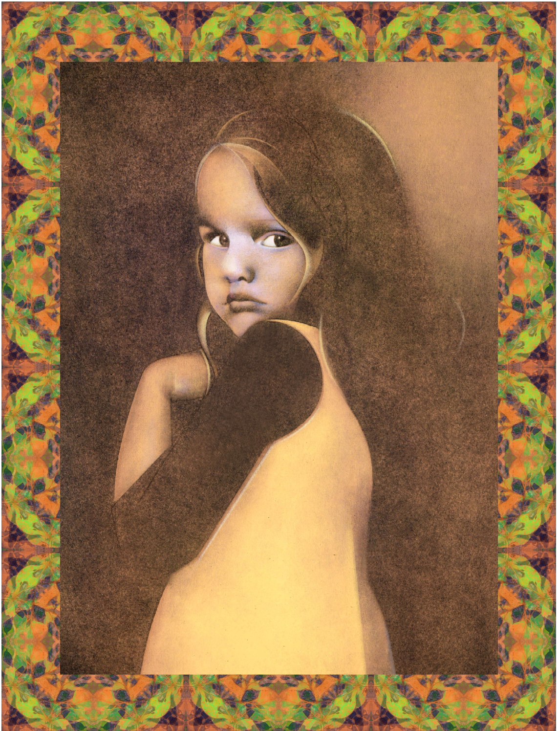
The Lobster Quadrille